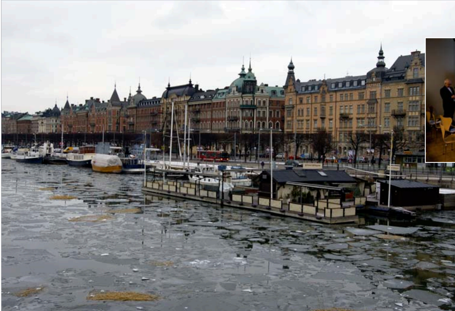
STOCKHOLM IN JANUARY